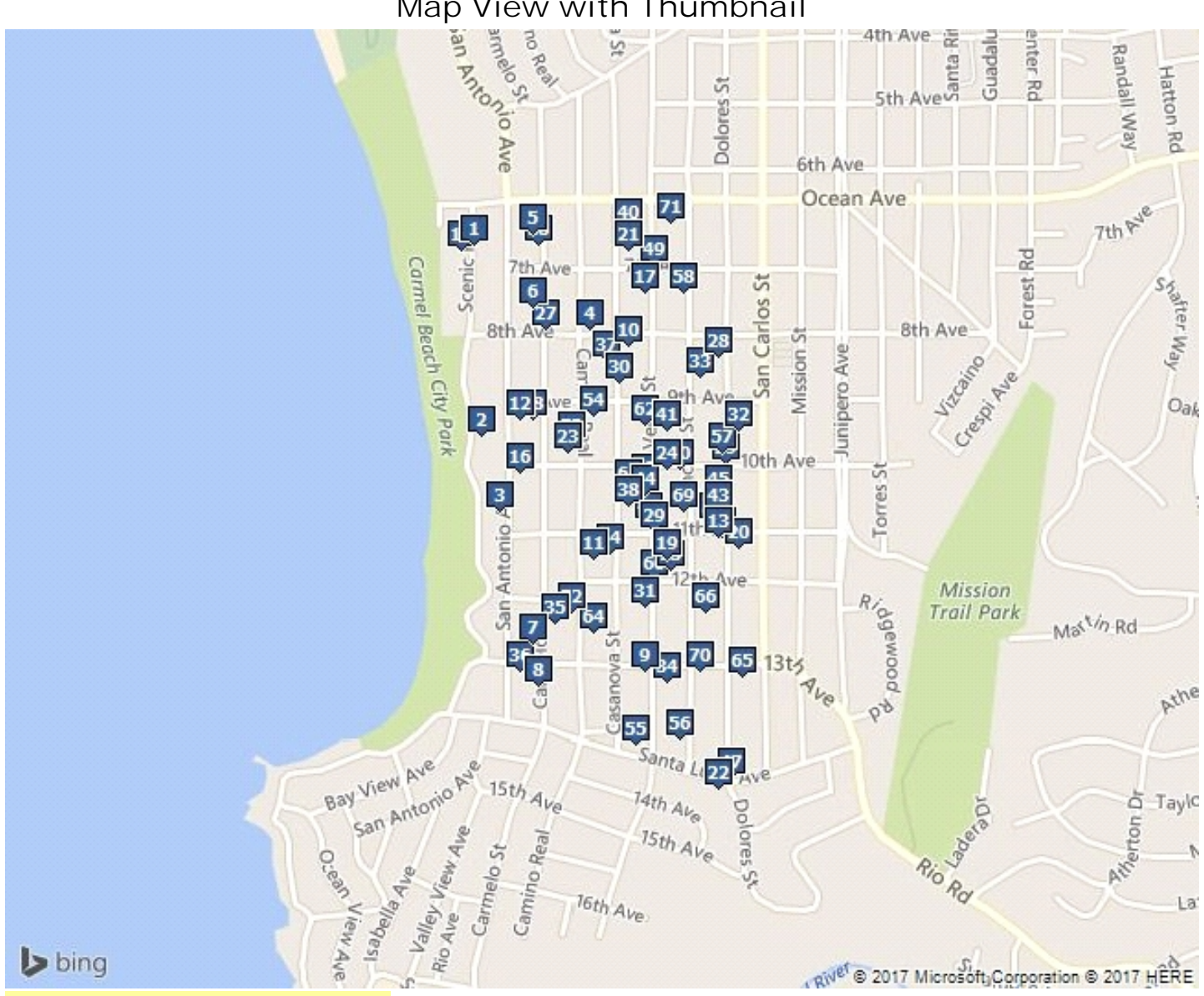
4 of 75 Listings could not be mapped